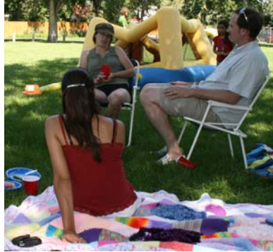
Neighbours gather for lunch while the kids play nearby.

We love our neighbours and want to create a stronger sense of community in our fine neighbourhood! Our formal efforts to bring the neighbourhood together began when we started meeting many young families and thought it would be great to get them together. We thought a potluck would be just the thing!