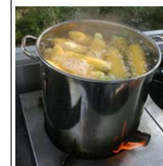
Mmmm! Corn on the cob!