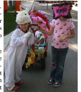
A costume parade is part of the festivities.

Each summer our street hosts a block party. We have games, a costume parade, live music, and a dinner. So, how do we plan our block parties? Well, the first year was the most work. Several families covered the financial costs initially, and we formed a Society ( http://www.servicealberta.ca/716.cfm ) so that we could get insurance (a requirement). We also made sure someone was in charge of security and first aid (required for insurance). Then we bought a permit at City Hall. Our meetings were another great reason to party with our neighbours!