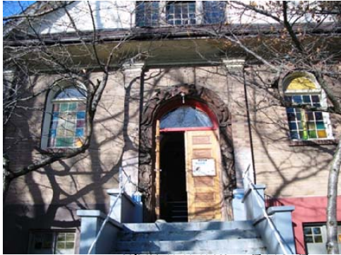
A neighbourhood association meeting house.