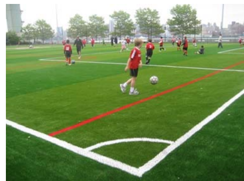
The Civic Field park can once again be full of life.