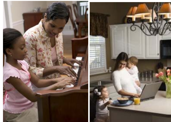
Home businesses contribute to the economic strength of Lethbridge. Music teachers raise the next generation of aspiring artists.