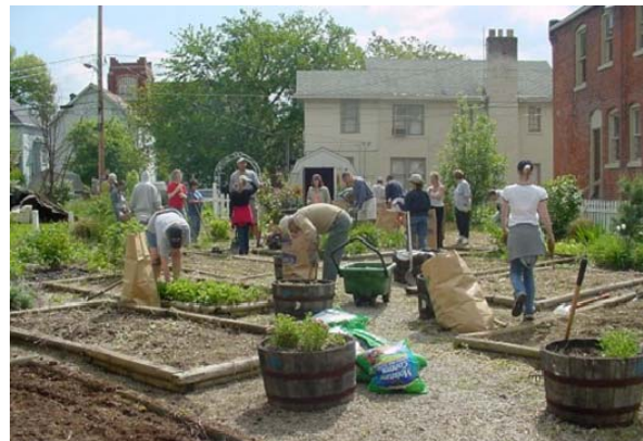
Local food feeds the community, saves the planet, and brings people together.