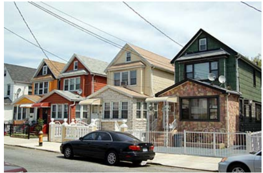
Social housing should be mixed in with market/regular housing, dispersed throughout the city.

In Lethbridge, we are building the future together!