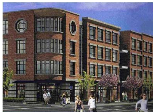
Medium density housing can be attractive.